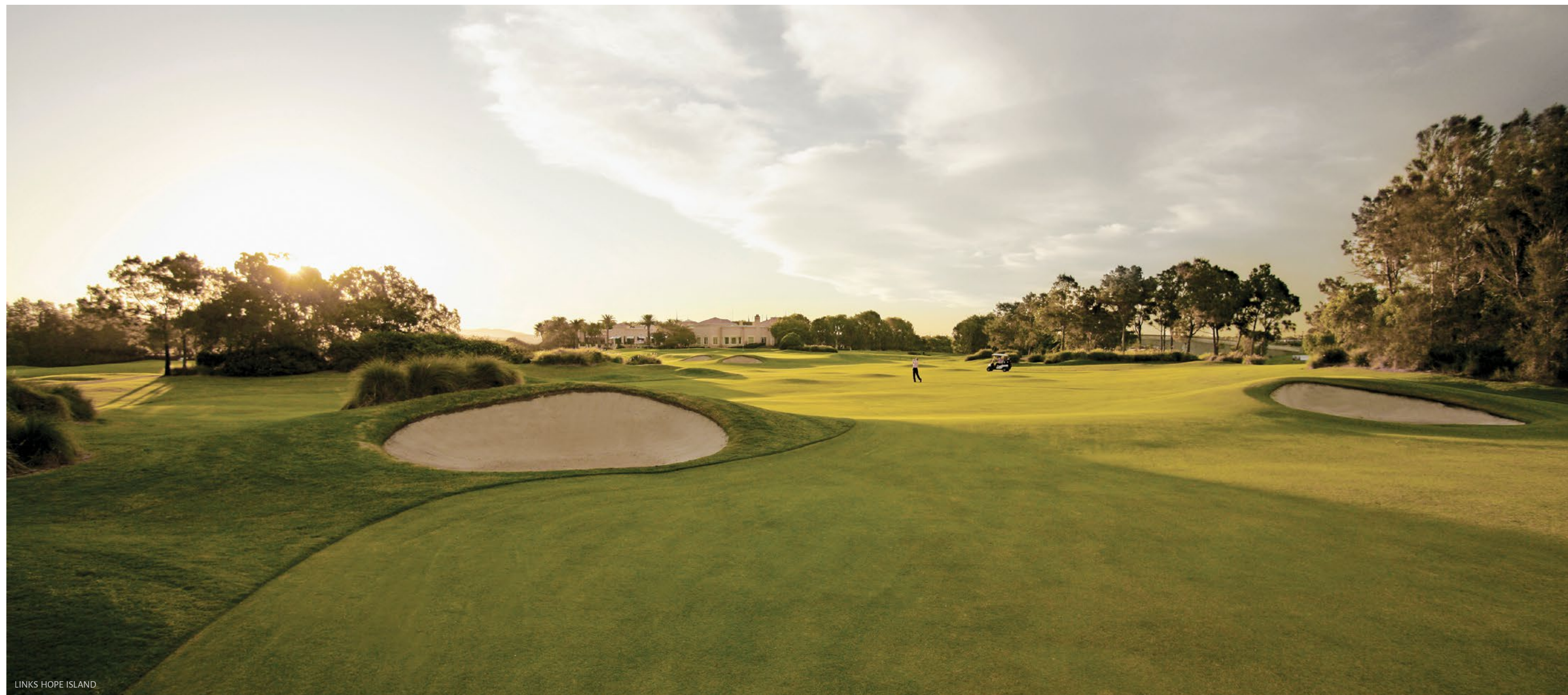
LINKS HOPE ISLAND